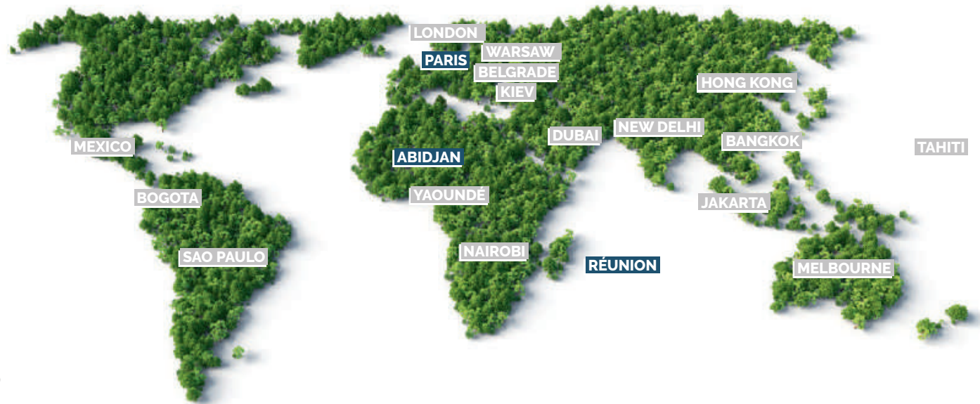
Voltere and Egis main offices

Expertise and creativity are best used in close proximity to each region. With multiple offices in France and abroad, our teams develop an expert knowledge of the social and economic dynamic of every region, creating long lasting partnerships with operators. These are key factors to the success of our projects.