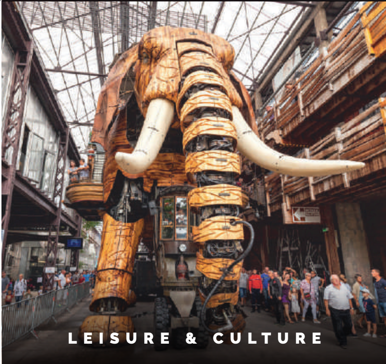
LEISURE & CULTURE