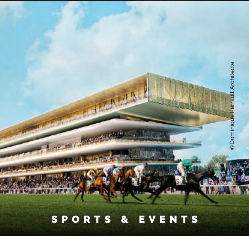
SPORTS & EVENTS