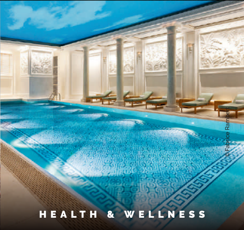
HEALTH & WELLNESS